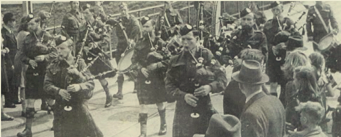
The liberation of Groningen, Netherlands, April, 1945