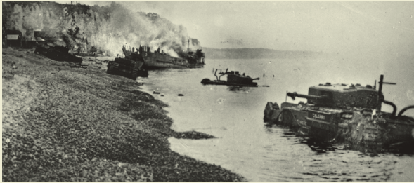
Dieppe, August 19, 1942. Of the 566 Essex Scottish troops in the Raid, only 55 returned to England, many of them wounded.